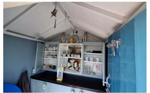
116 Kings Esplanade, Hove, BN3